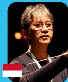
Budi Utomo Prabowo INDONESIA